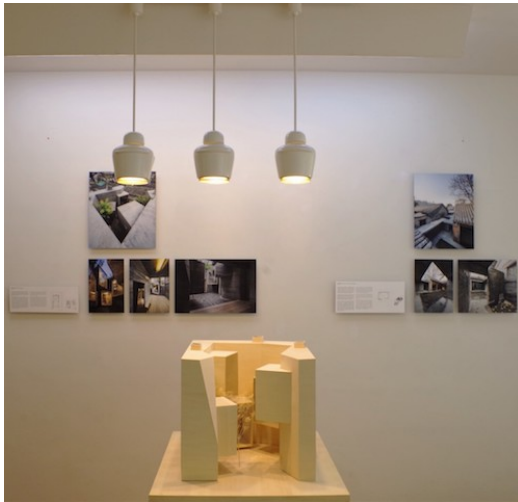
20 – Installation view