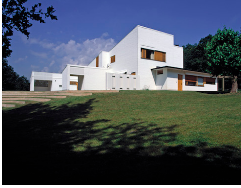
11 – Maison Louis Carré 1959