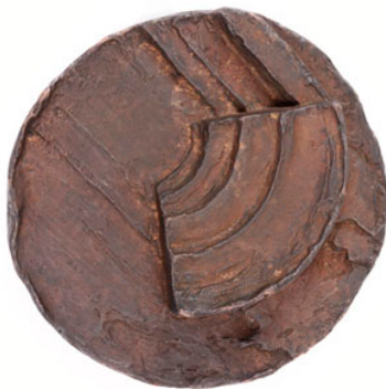
10 – The Alvar Aalto Medal