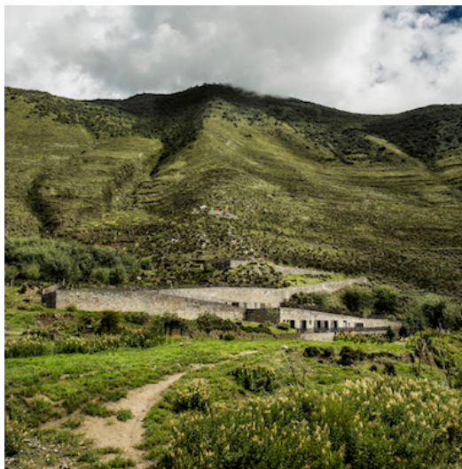
3 – Niangou Terminal, Tibet 2014