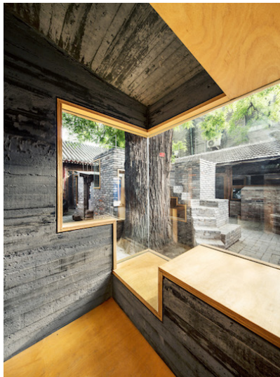
2 – Micro Yuan'er, Beijing 2014