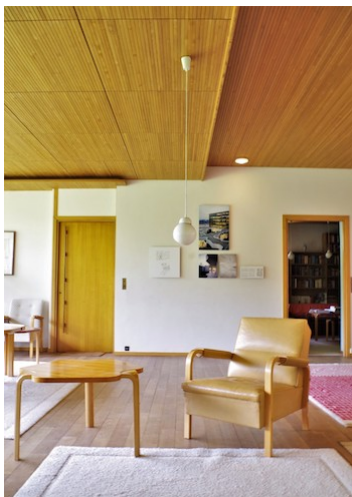
18 – Installation view