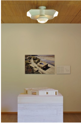
15 – Installation view