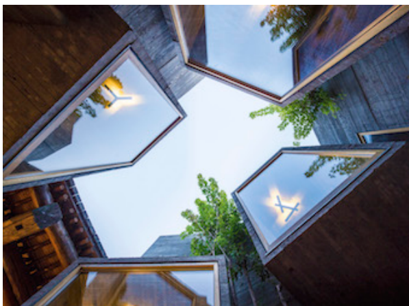
7 – Micro Hutong, Beijing 2013