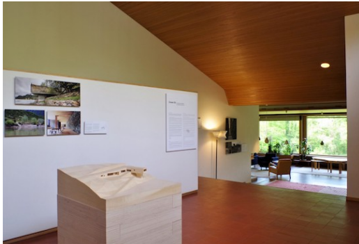
13 – Installation view