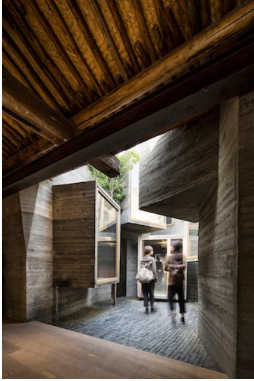
8 – Micro Hutong, Beijing 2013