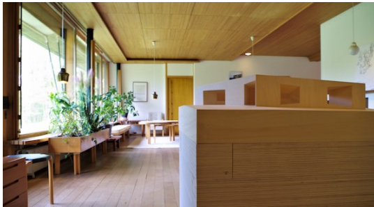
16 – Installation view