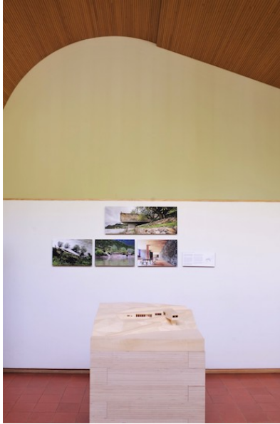
12 – Installation view