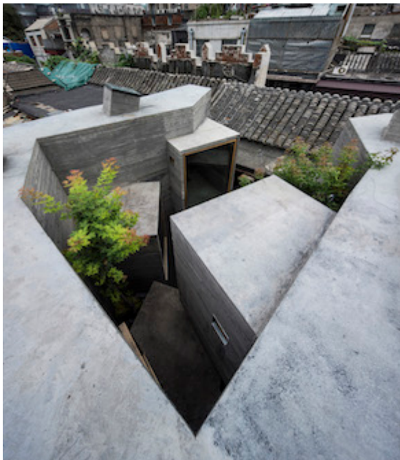
6 – Micro Hutong, Beijing 2013