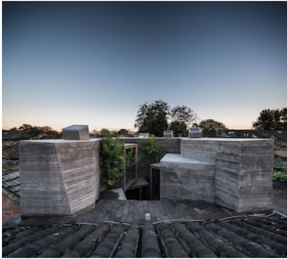
5 – Micro Hutong, Beijing 2013