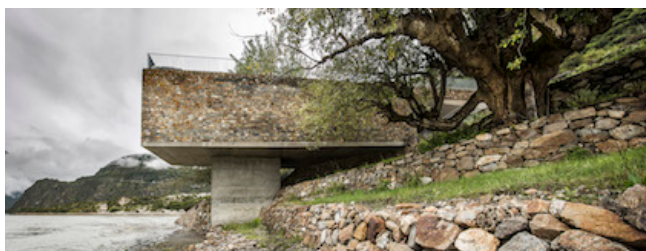
4 – Yarlung Tsangpo Boat Terminal, Tibet 2008