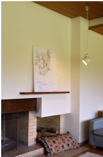
17 – Installation view