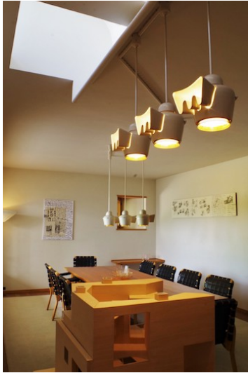
19 – Installation view