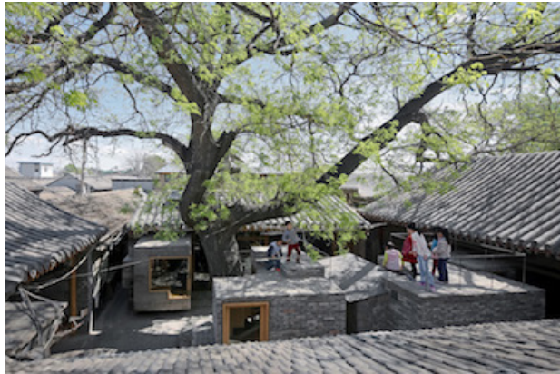
1 – Micro Yuan'er, Beijing 2014